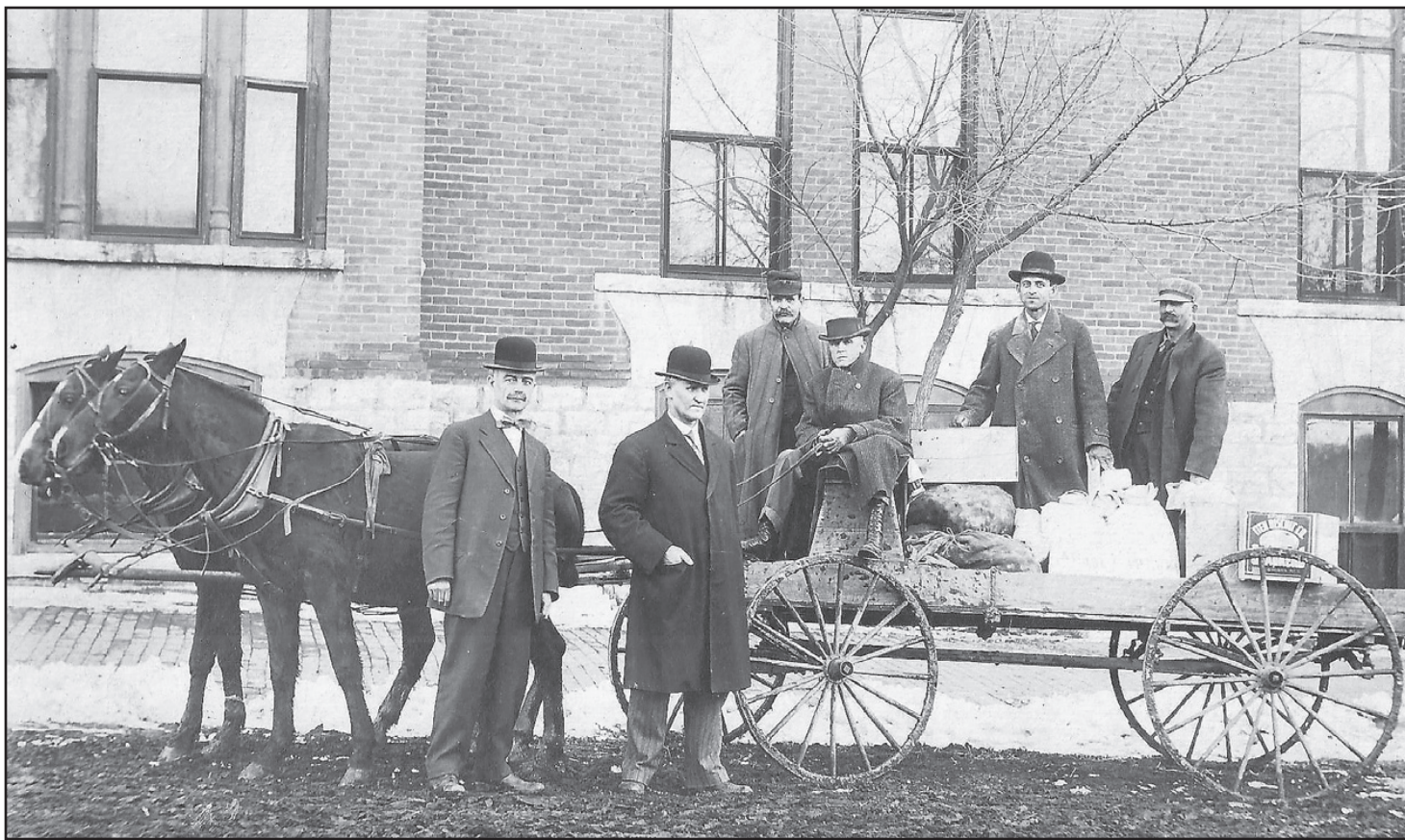
Christmas in Holton 108 years ago....